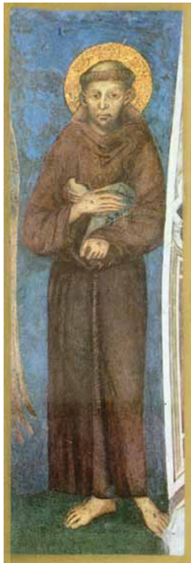
One of the earliest known portraits of Francis, painted shortly after his death.

Francis of Assisi astounded and inspired the Church by taking the Gospel literally—not in a narrow fundamentalist sense, but by actually following all that Jesus said and did, joyfully, without limit and without any self-importance.